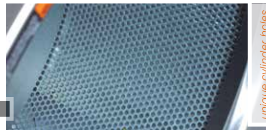
unique cylinder holes