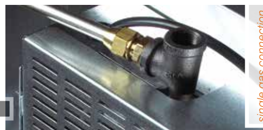
single gas connection