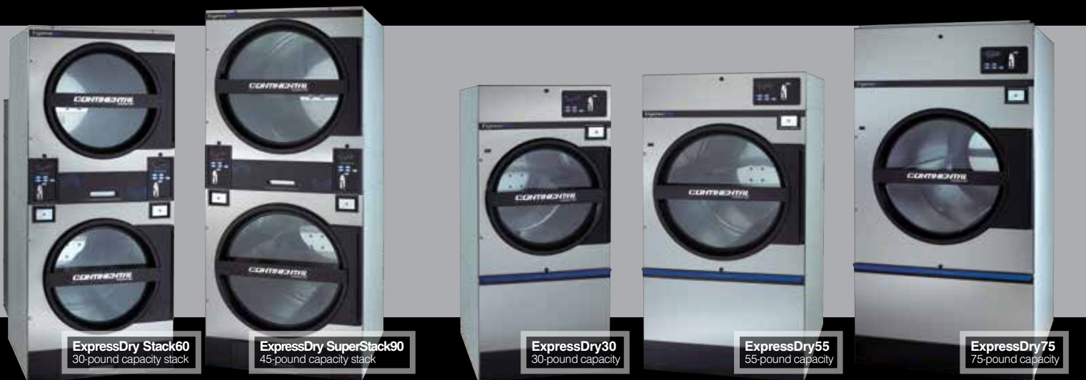
ExpressDry Stack60 30-pound capacity stack