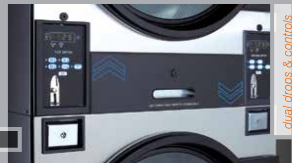
dual drops & controls